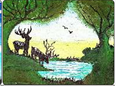
VIDUSHI RAJ (VII-D)