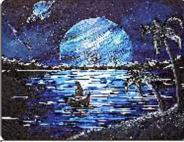
PIYUSH RAJ (VIII-H)