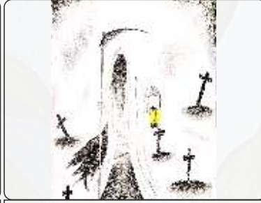
N LOPAMUDRA SAHU (VII-C)