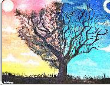
VIDUSHI RAJ (VII-D)