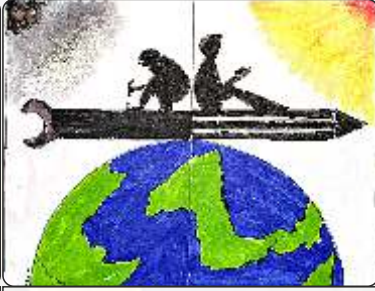
SAAIKA SALIM (VI-F)