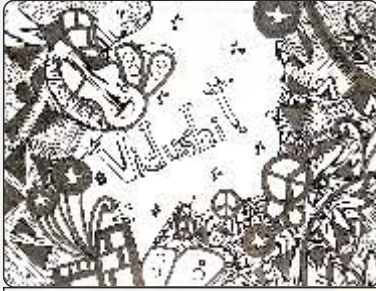
VIDUSHI RAJ (VII-D)