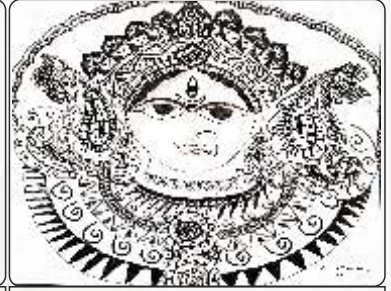
BHANU PRATAP SINGH (VII-C)