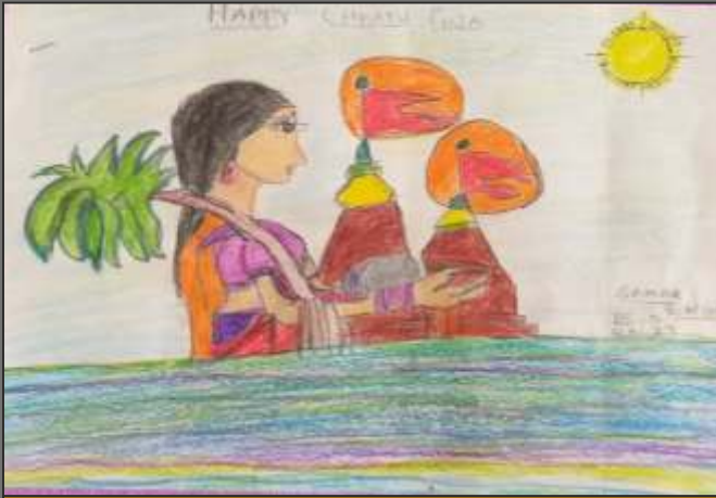
SAMAR SINGH (III-D)