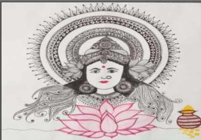
DIVYANSHI AGRAWAL (V-C)