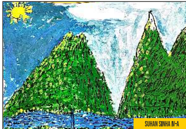
SURAN SINHA IV-A