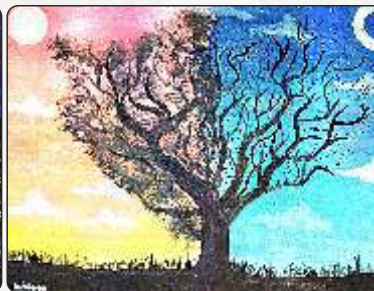
VIDUSHI RAJ (VII-D)