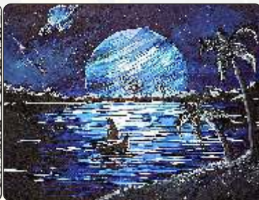
PIYUSH RAJ (VIII-H)