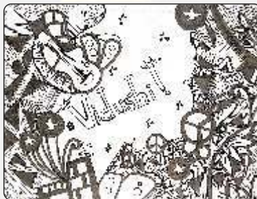
VIDUSHI RAJ (VII-D)