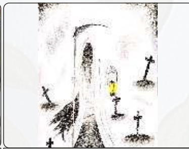
N LOPAMUDRA SAHU (VII-C)