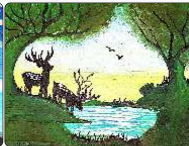
VIDUSHI RAJ (VII-D)