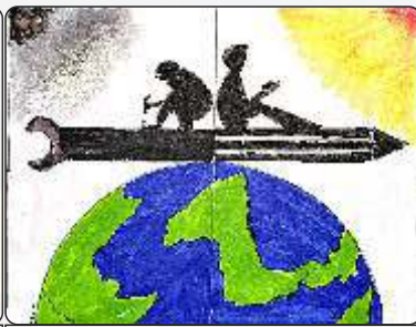
SAAIKA SALIM (VI-F)