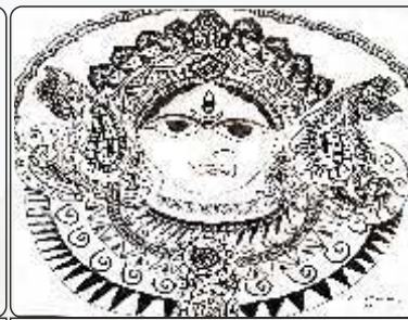
BHANU PRATAP SINGH (VII-C)