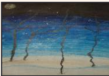
DIVYAKRITI VERMA [iv-h]