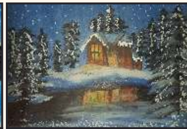
SHRISHTI SHREYA [iv-f]