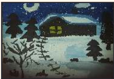
AFSHEEN ARSHY [iv-g]