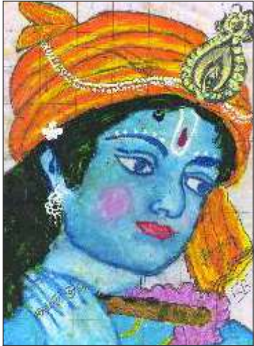
ANURAG RAMAN (V-B)