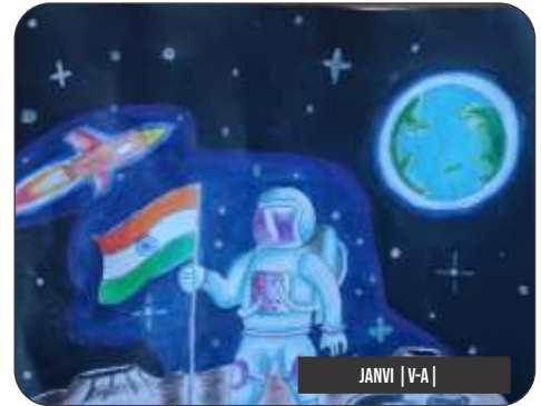
JANVI | V-A |