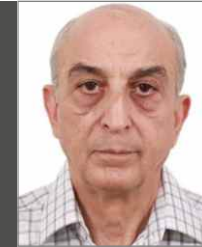
Shri V.K. Shunglu